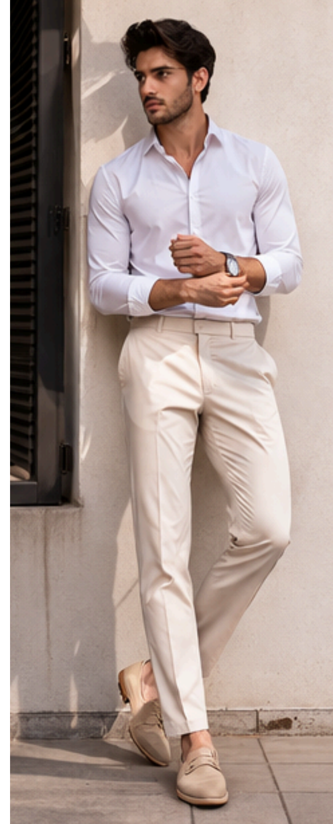
○ ○ WHITE + BEIGE