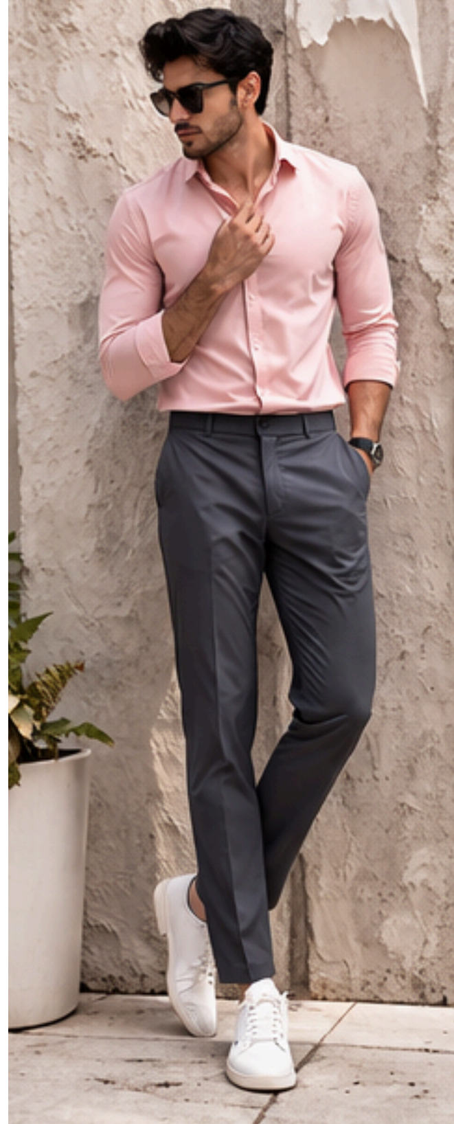
● ○ PASTEL PINK + SLATE GREY