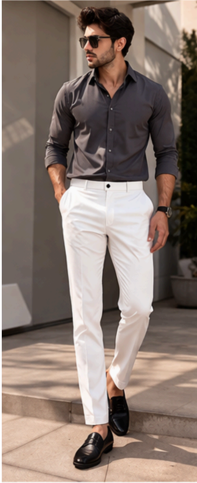
● ○ CHARCOAL + WHITE