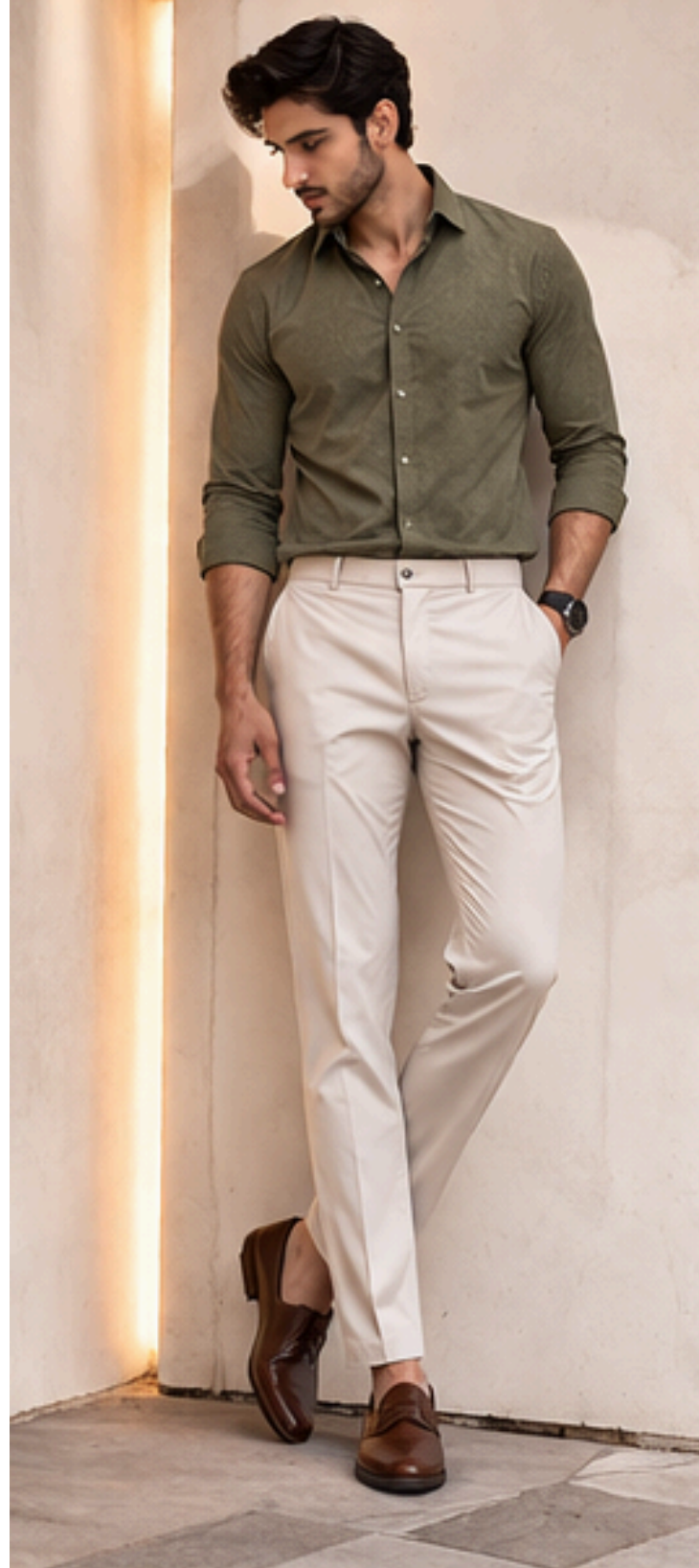
● ○ OLIVE GREEN + CREAM