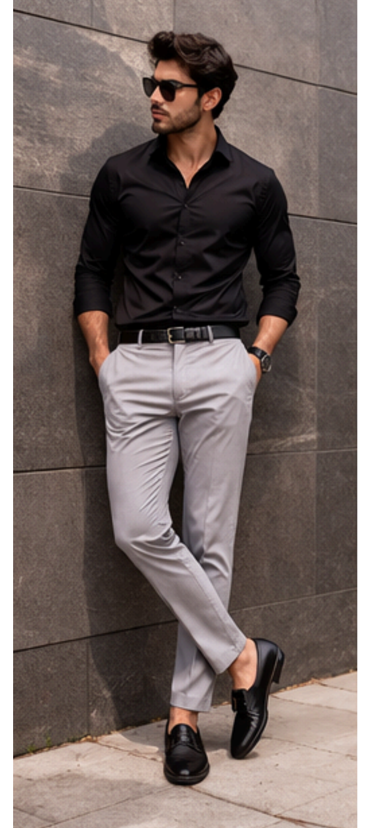
● ○ BLACK + LIGHT GREY